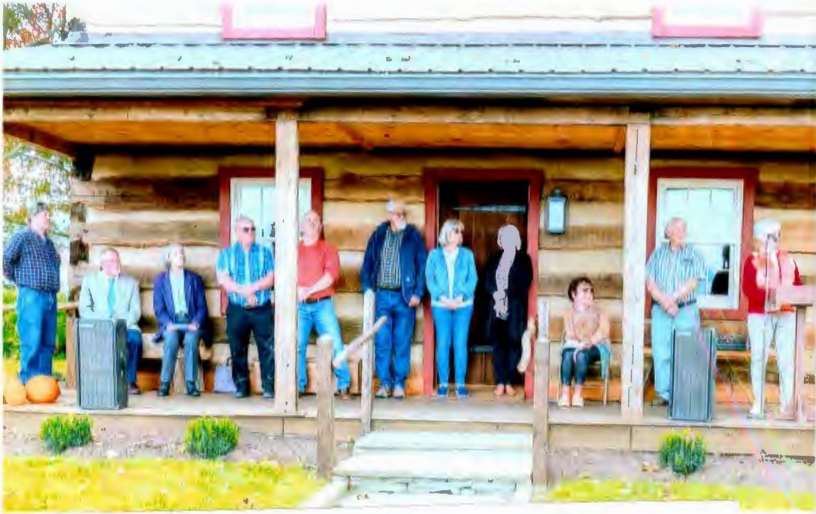
HUMBLE HOUSE DEDICATION PARTICIPANTS