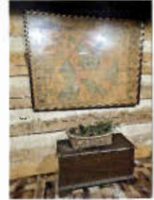
HUMBLE HOUSE DURING THE PIOUS SPRINGS CHRISTMAS HOME TOURS.