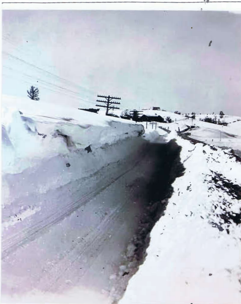
THE CUMBERLAND HIGHWAY SOUTH OF BERLIN. A WINTER FROM THE PAST!