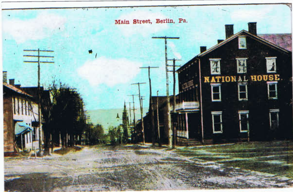
NATIONAL HOUSE. POST CARD DONATED BY TERRY DePHILLIPS