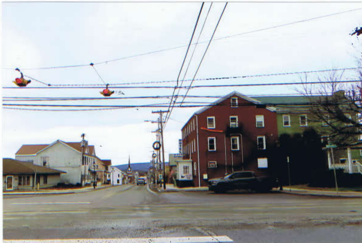
NEW NATIONAL HOTEL