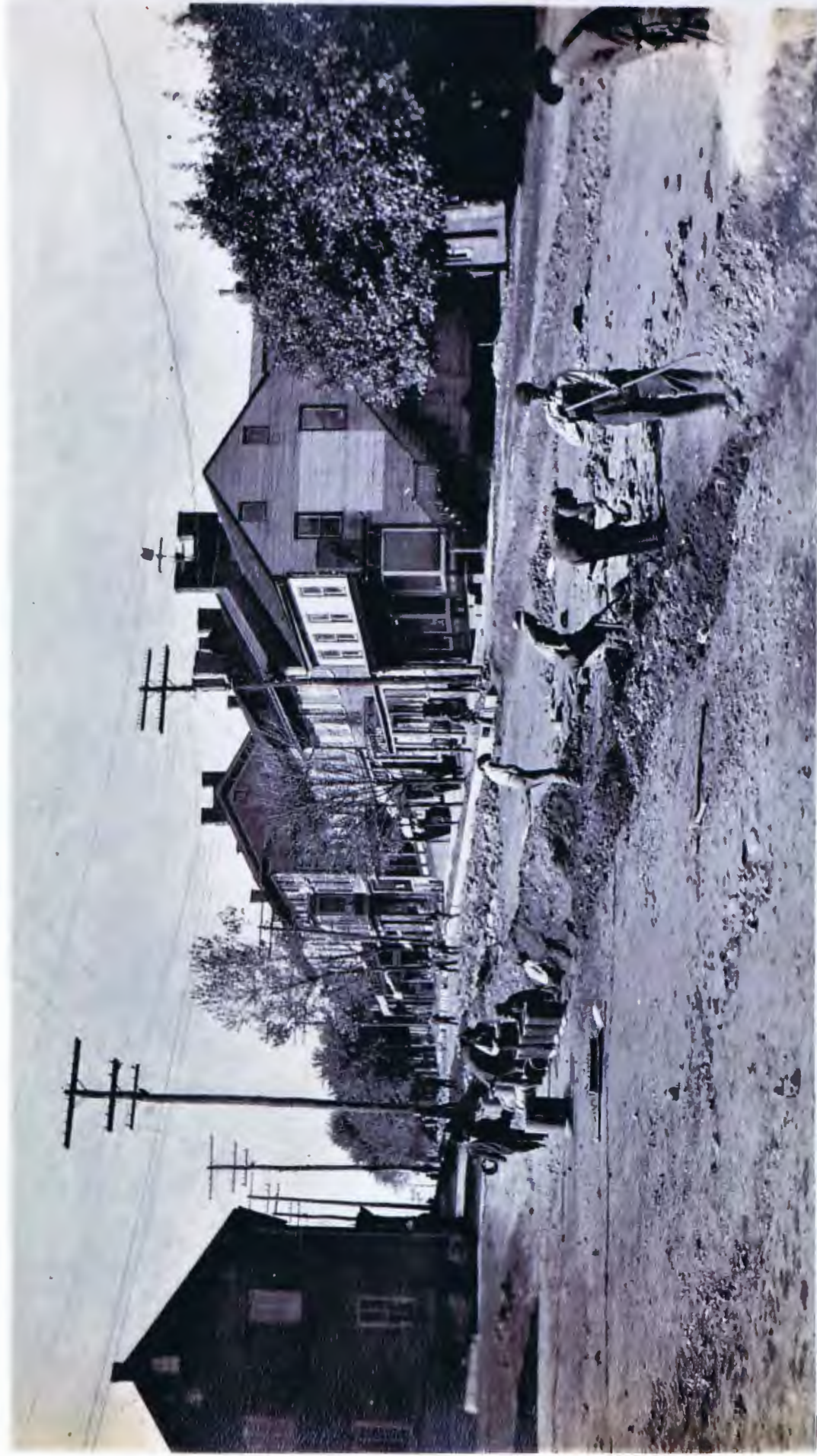
Main St. before the paving began. 1916.