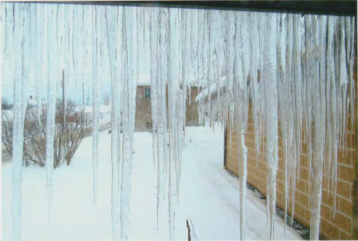
A VIEW OUTSIDE THER WINDOW AT BAHS IN FEBRUARY