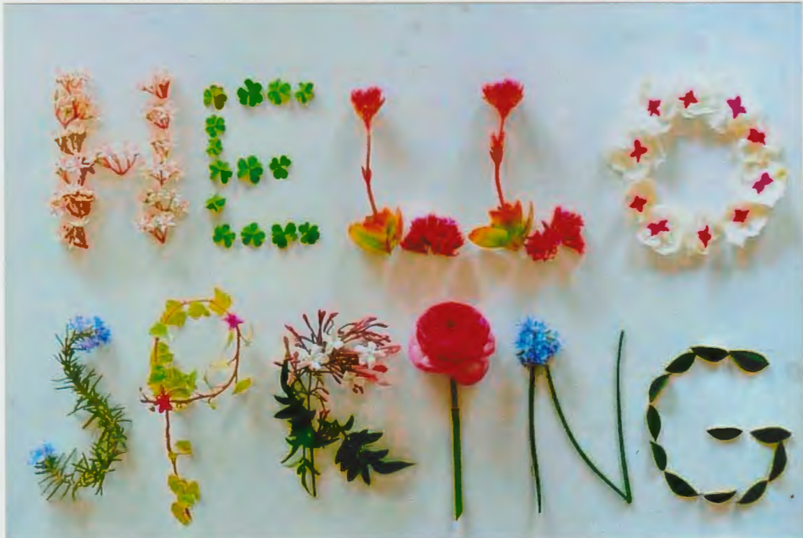
LOOKING FORWARD TO WELCOMING SPRING AND ENJOYING THE SPRING MEMOS!